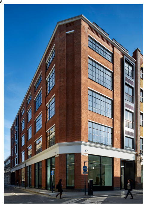
Hale Brown | Architects