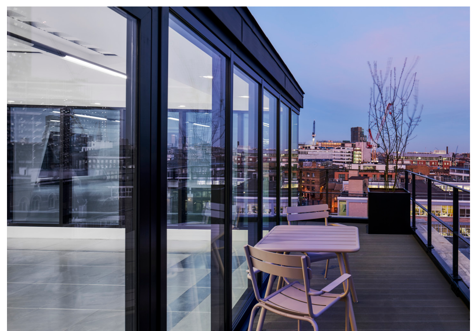
New south-facing roof terrace